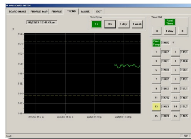
Process temperature over time (shown for 2 hour intervals)